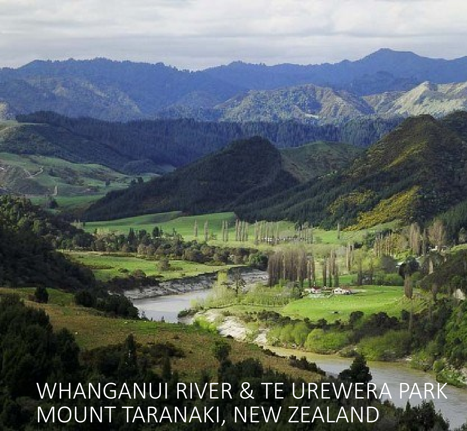
WHANGANUI RIVER & TE UREWERA PARK MOUNT TARANAKI, NEW ZEALAND